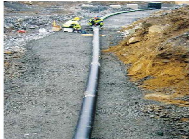
MetroTaifun composite pipe installation