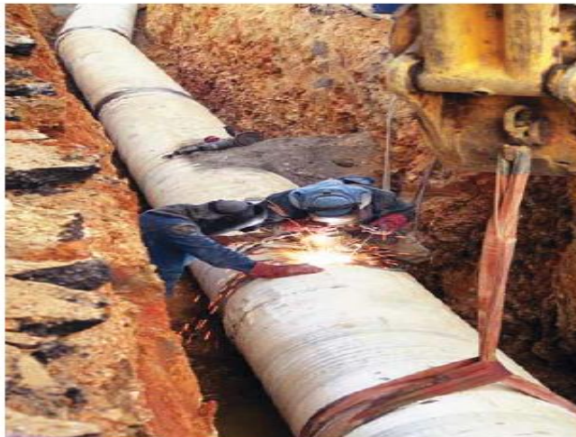
Traditional pipe installation